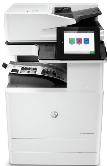
HP LaserJet Managed MFP E82540dn

Businesses that stay ahead don't slow down. It's why HP built the next generation of HP LaserJet MFPs—to power productivity with a streamlined design that delivers premium quality, maximum uptime, and the strongest security. 1