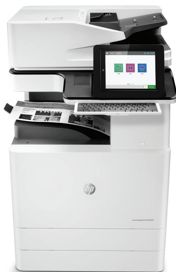
HP LaserJet Managed Flow MFP E82540z