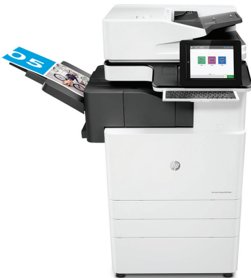
HP Color LaserJet Managed Flow MFP E87660z

1 Purchase of optional paper trays and output accessory availability varied by device